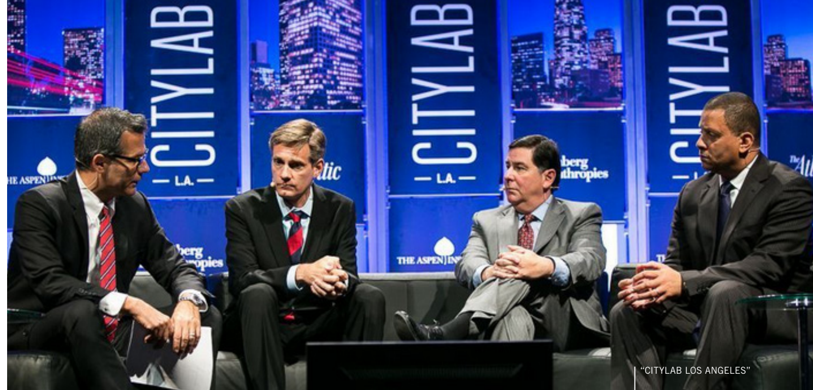
"CITYLAB LOS ANGELES"

to support kids, who desperately need Pre-K, who need better educations and more opportunities. And by that, I don't just mean preparing them for STEM degrees, but providing apprenticeships and on-the-job training for people who aren't academically inclined. We need to raise the minimum wage and restore and strengthen the safety net—and we need to spend literally trillions of dollars on not just repairing old infrastructure, but building new infrastructure for a post-industrial way of life.