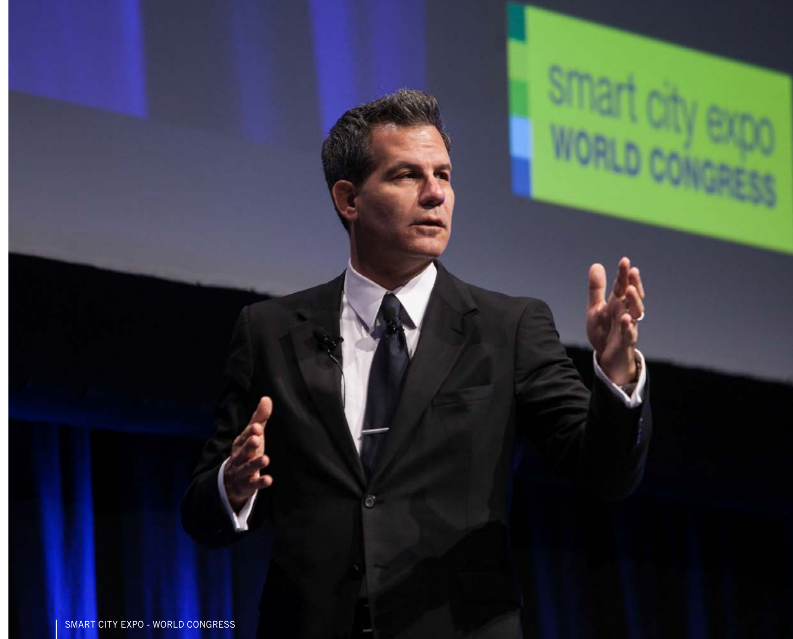
SMART CITY EXPO - WORLD CONGRESS

CATALYST: How is capitalism evolving - for better or worse?