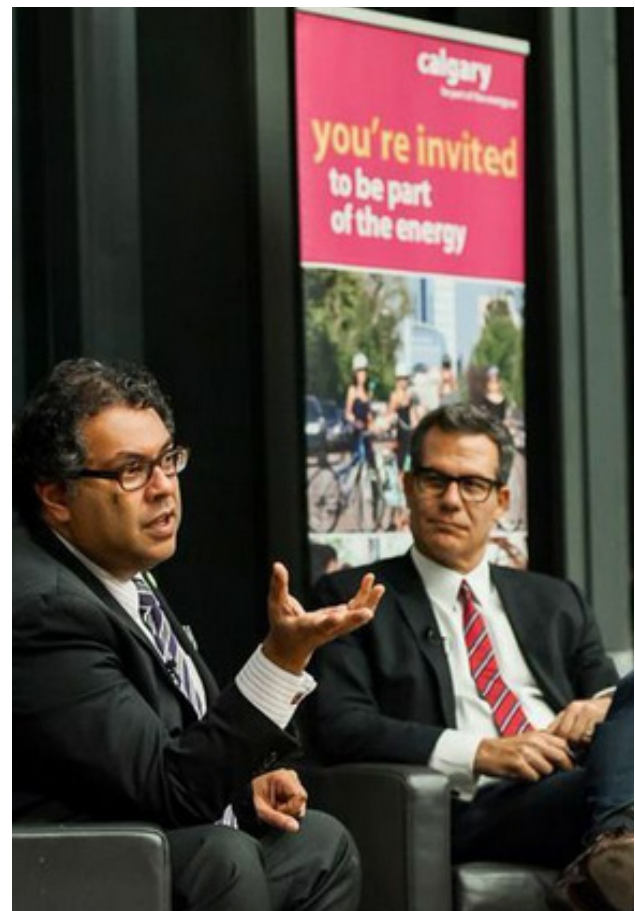
THE ROLE OF BIG CITIES IN CANADA ROTMAN SCHOOL OF MANAGEMENT, UNIVERSITY OF TORONTO

We have to make our cities and towns more livable, more wired, faster and more efficient. We need to support individual entrepreneurs, but even more importantly, we need