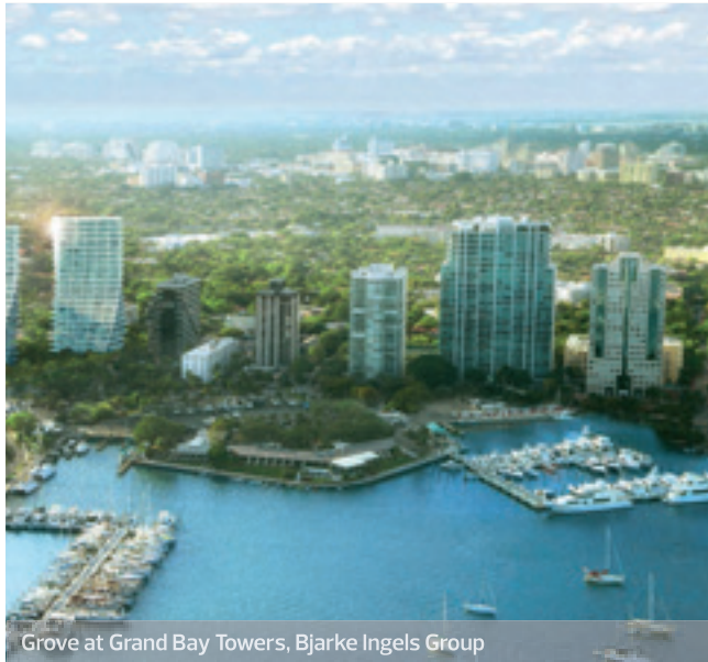
Grove at Grand Bay Towers, Bjarke Ingels Group