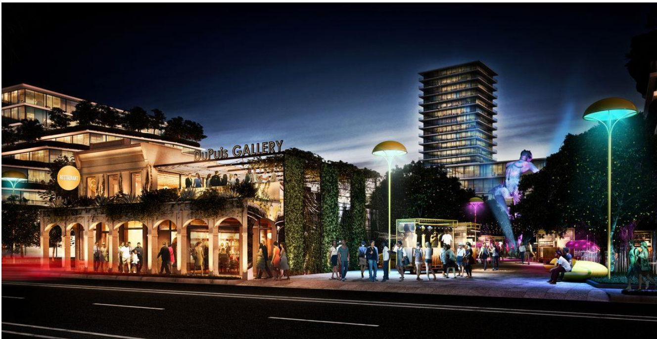
An early rendering of the Magic City Innovation District