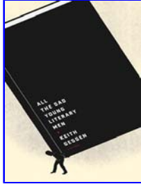
All the Sad Young Literary Men