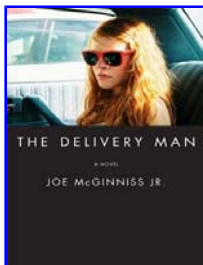
The Delivery Man

Florida (Basic, $26.00, non-fiction, due in March). This was quite interesting. It is the third book by Florida detailing his concept of the creative class, but this one is not just limited to that type of person. He looks at why a person fits in a certain place. Through meticulous studies he and his team try to figure out what makes a person choose to live in, say, Chesterfield instead of St. Louis City or Rolla. And, what it is about that person and about that place that makes one feel comfortable. For instance, I would like to visit Rolla but I wouldn't want to live there. Same for New York City or Chicago—I love visiting but I would never move there. Florida would say that I choose to live in St. Louis because it's affordable, it's architecture appeals to me, it has accessible cultural amenities and I appreciate and demand the openness and curiosity and variety of my neighborhood and of the folks who live in it. And I'm not particularly excited by lots of space and nature, nor by crushes of humanity. I felt like he was a bit too big-citycentric, though, almost like he felt he had to explain why someone would want to live in St. Louis or Cleveland or Baltimore because if he didn't explain it, no one would get it.