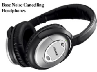
Bose Noise Cancelling Headphones