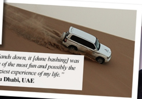
"Hands down, it [dune bashing] was one of the most fun and possibly the craziest experience of my life." Abu Dhabi, UAE