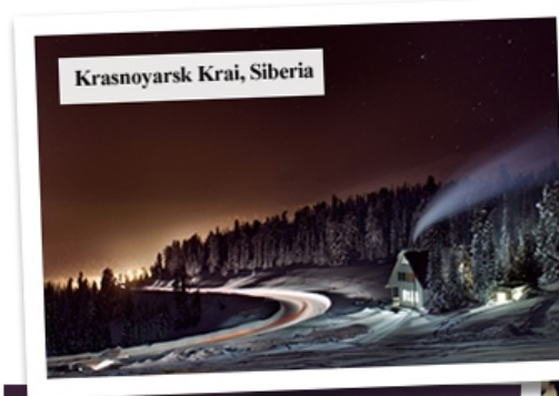
Krasnoyarsk Krai, Siberia