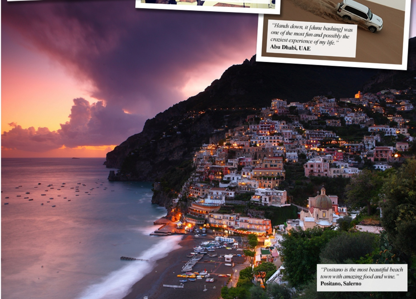
"Positano is the most beautiful beach town with amazing food and wine." Positano, Salerno