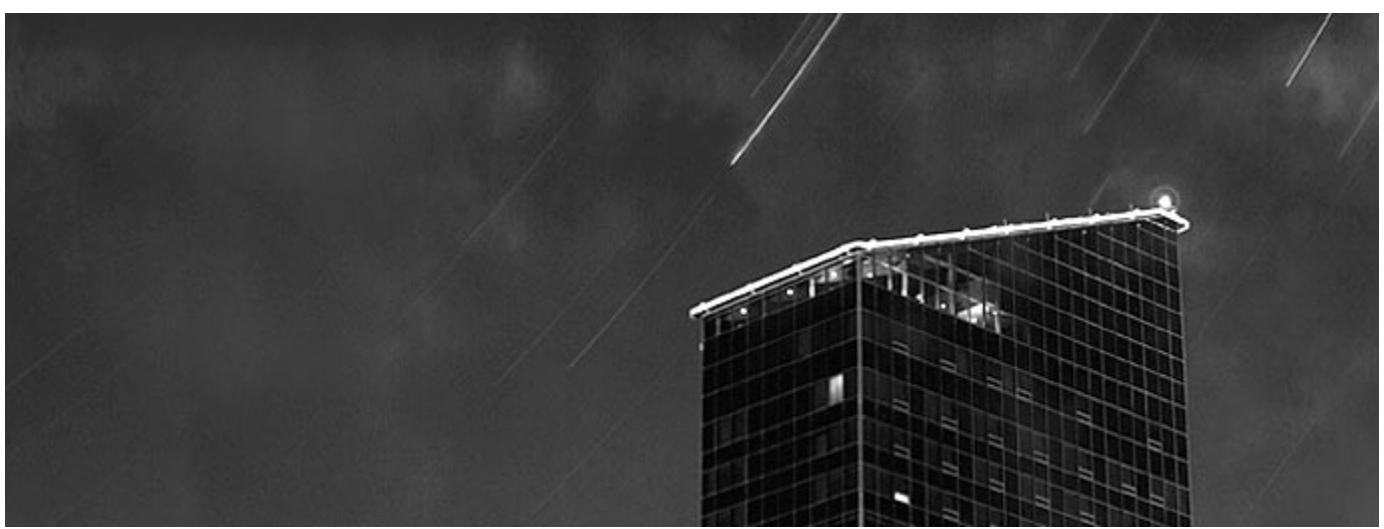
A long exposure over the Amway Grand Plaza Hotel produces star trails - Center City

Home | Neighborhoods | Features | Development News | Innovation & Job News | In the News | Photo Essays | Sign Up