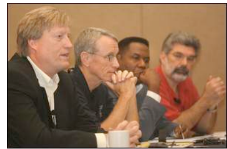
Buy this photo PHIL SEARS/Democrat

The following topics were discussed in other breakout sessions Saturday: